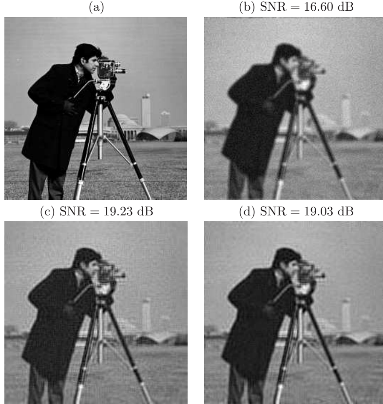
Figure 1. Original image (a), degraded one (b) and restored images using AA (c) and SA (d).

Figure 1 shows the reference cameraman image (a), the degraded one (b) and restored ones using AA (c) and SA (d). We notice that visually, the two restored images are quite similar. In terms of SNR, AA gives slightly better restored images with 0.2 dB of SNR improvement over SA.