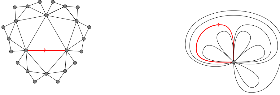
Figure 1: The beginning of the construction of \mathbb{T}_0 (on the left) and \mathbb{T}_* (on the right). Note that these are two different triangulations: \mathbb{T}_0 has infinitely many vertices whereas \mathbb{T}_* has only one.

We finally introduce two important examples of "degenerate" planar triangulations \mathbb{T}_0 and \mathbb{T}_* with infinite vertex degrees. We denote by \mathbb{T}_0 the triangulation obtained by gluing the edges of the triangles along the structure of a complete binary tree (as on the left of Figure 1). This is also the natural way to extend the PSHT \mathbb{T}_\lambda to the case \lambda = 0 . On the other hand \mathbb{T}_* (on the right of Figure 1) is the only infinite, planar triangulation with only one vertex: it is obtained by forming a triangle with three loops, and then recursively adding two loops inside of each loop to form new triangles. We highlight that our definition considers \mathbb{T}_0 and \mathbb{T}_* as two distinct objects, even if they have the same dual. Indeed, the vertices are not glued in the same way in \mathbb{T}_0 and in \mathbb{T}_* . We are now able to state our main theorem.