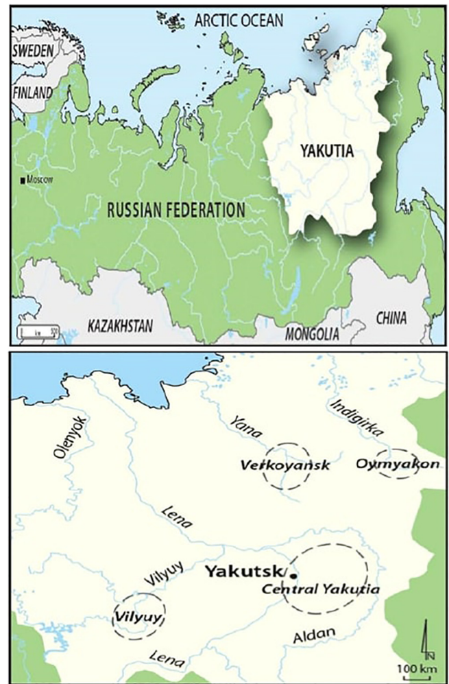
Fig. 1. Localisation of the studied areas.

The French Archaeological Mission in Oriental Siberia (MAFSO) excavated more than 150 tombs dated from the 15th to the 19th century that were well preserved by permafrost. For this study, we sampled the femur from 61 individuals (37 men, 20 women and 4 children). These originated from three large regions of cattle breeders, that are otherwise ecologically and economically very different. Central Yakutia ( n = 36 ) is a large cattle breeding zone with numerous “ alas ” (thermokarstic lakes surrounded by pastures) (Crubézy and Alexeev, 2012). Viluy ( n = 10 ), is very humid and is known for its abundance of fish