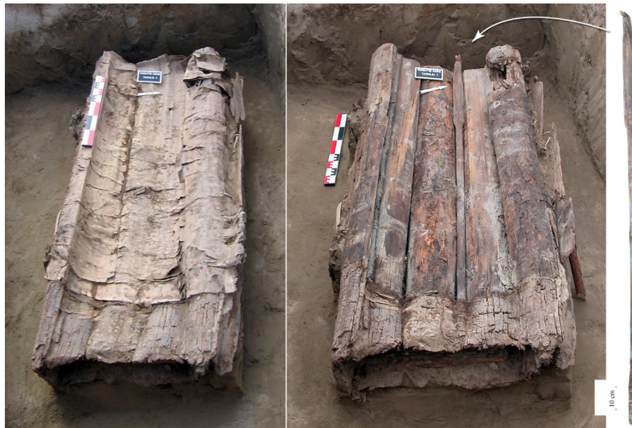
Fig. 5. Fishing tool in the tomb Taralay, Central Yakutia, before 1700.

The diet of Yakut population from 15th to 19th centuries appears relatively homogeneous according to ethnographic data. However, \delta^{13}\text{C} and \delta^{15}\text{N} values demonstrate a clear distinction between different geographical areas of Yakutia. We also documented variations in dietary habits related to social status. Men and women had the same type of diet. These results are correlated with ethnographical and historical evidences. We noticed considerable variation in \delta^{15}\text{N} values for terrestrial animals while \delta^{13}\text{C} turned out to be a less significant variable. We found that the N isotope composition of suckling horses was notably elevated. We also confirmed the existence of wide variation in \delta^{13}\text{C} and \delta^{15}\text{N} among fish from rivers and lakes. This indicates that the high \delta^{15}\text{N} values measured in humans could be explained not solely by an intake of freshwater fish, but also by the consumption of young animals, especially foals. In this context, it would be interesting to analyse the isotopes of sulphur and strontium/calcium and barium/calcium ratios (Balter et al., 2001; Balter and Simon, 2006) to distinguish the consumption of freshwater fish and terrestrial animals (Privat et al., 2007).