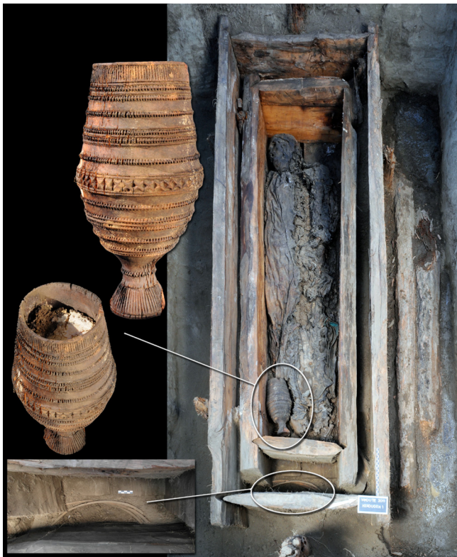
Fig. 4. The ribs of the horse and the ritual cup tchoron with the dairy product in the tomb Kerdugen, 1700–1750 CE.

reason that fish was not considered to be honorific as being a part funeral meal. The crucian carp bones investigated for this work come from the Jarama site where a few fish bones were discovered outside of the coffins of three child tombs. Funeral meals in analysed human tombs consists mostly of meat remains (38/45), and sometimes were associated with dairy products (12 cases). Milk product is rarely deposited by itself (3/45), nevertheless numerous vessels present in almost all tombs with artefacts (43/45) could initially have contained milk. Comparing our results tomb by tomb with archaeological data, we