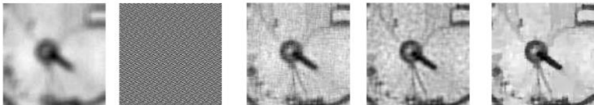
Fig 1. Example of degraded image, noise, and recovered images by different recovering techniques.

Image processing is a discipline of mathematics concerned with the development of methods for the transformation, analysis and interpretation of images in order to improve their quality and/or to obtain information. Image restoration problems are usually formulated as inverse problems, which consist in recovering an image as closely as possible to the original (or reference) one, from a set of observations degraded by some source of noise [1].