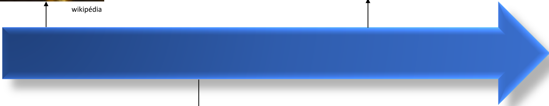
Christophe Buys-Ballots: 1845