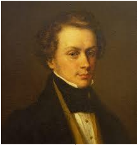
Christian Doppler: 1842