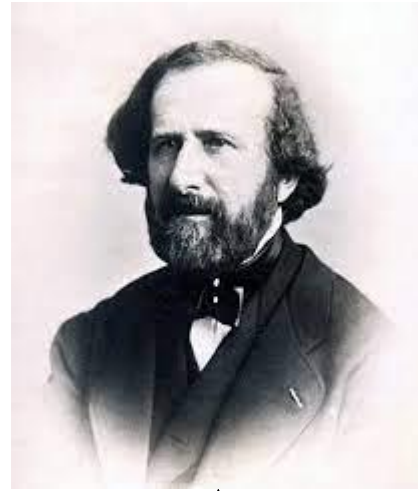
Hippolyte Fizeau: 1848