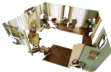
3D Color Point Cloud